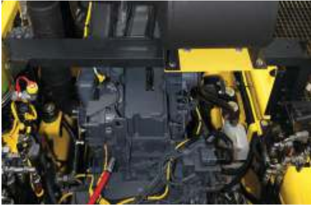
TCD 2015 V8.