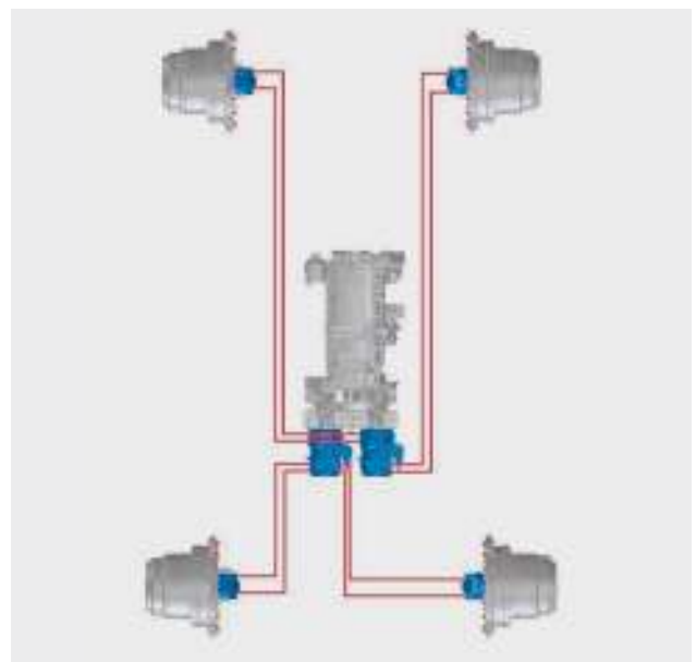
Twin-Pump-Drive (BC 473).