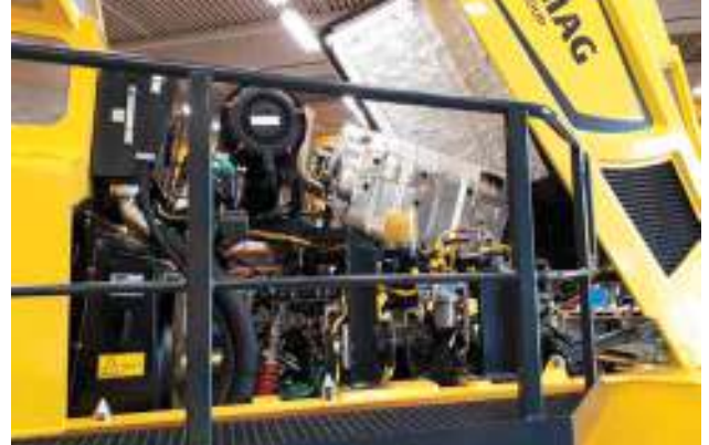
Well known, means facturer.