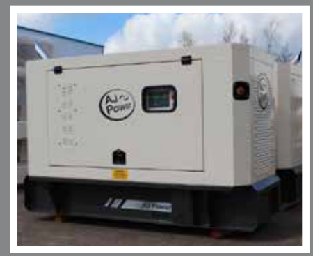
Please Note: Photos may not directly represent datasheet models