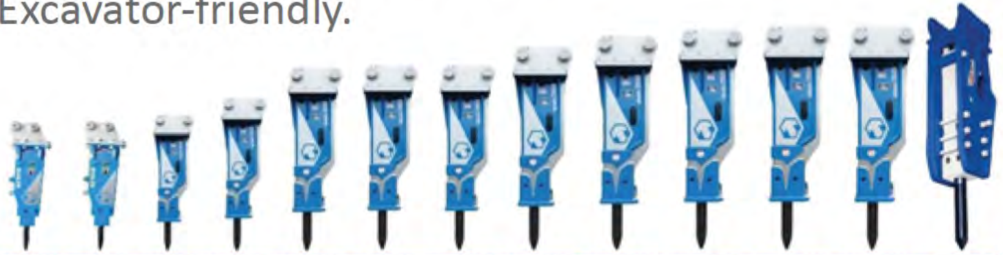
okada150 okada200 okada250 okada400 okada650 okada800 okada1000 okada1300 okada1500 okada2600 okada3600 okada6000 TOP800

Higher quality equals longer life. Performance testing for all units. Excavator-friendly.