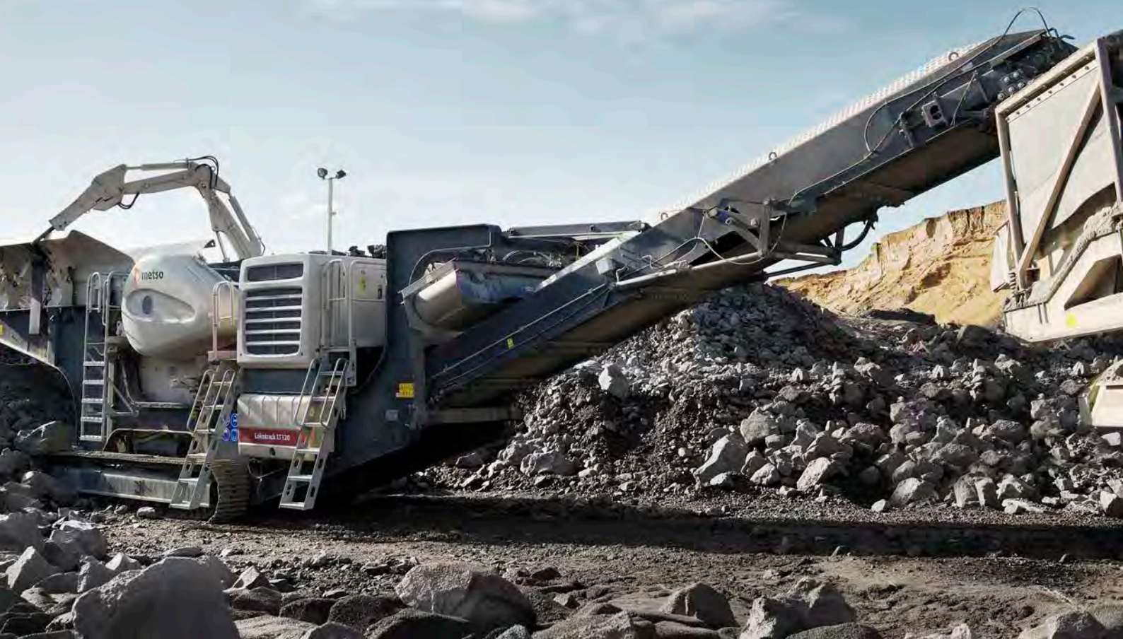
Metso Lokotrack LT120