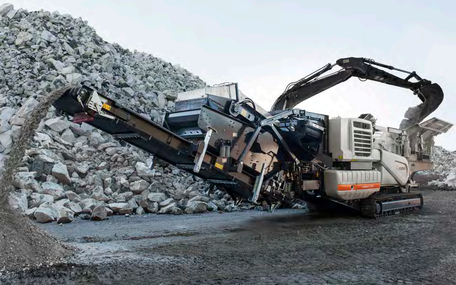
Metso Lokotrack LT1213S