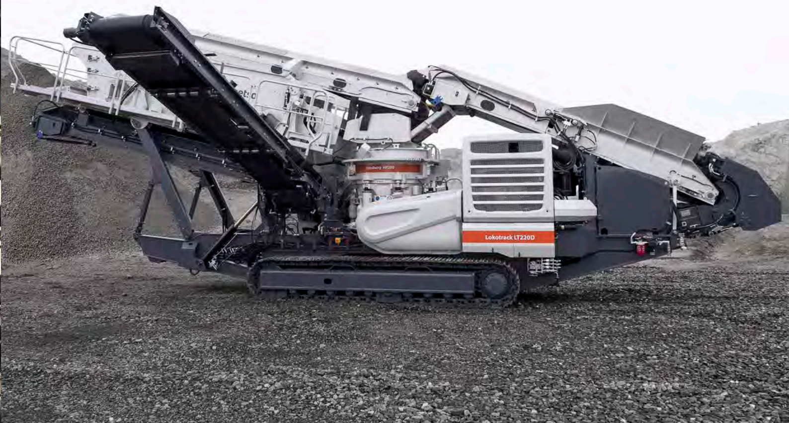
Metso Lokotrack LT220D