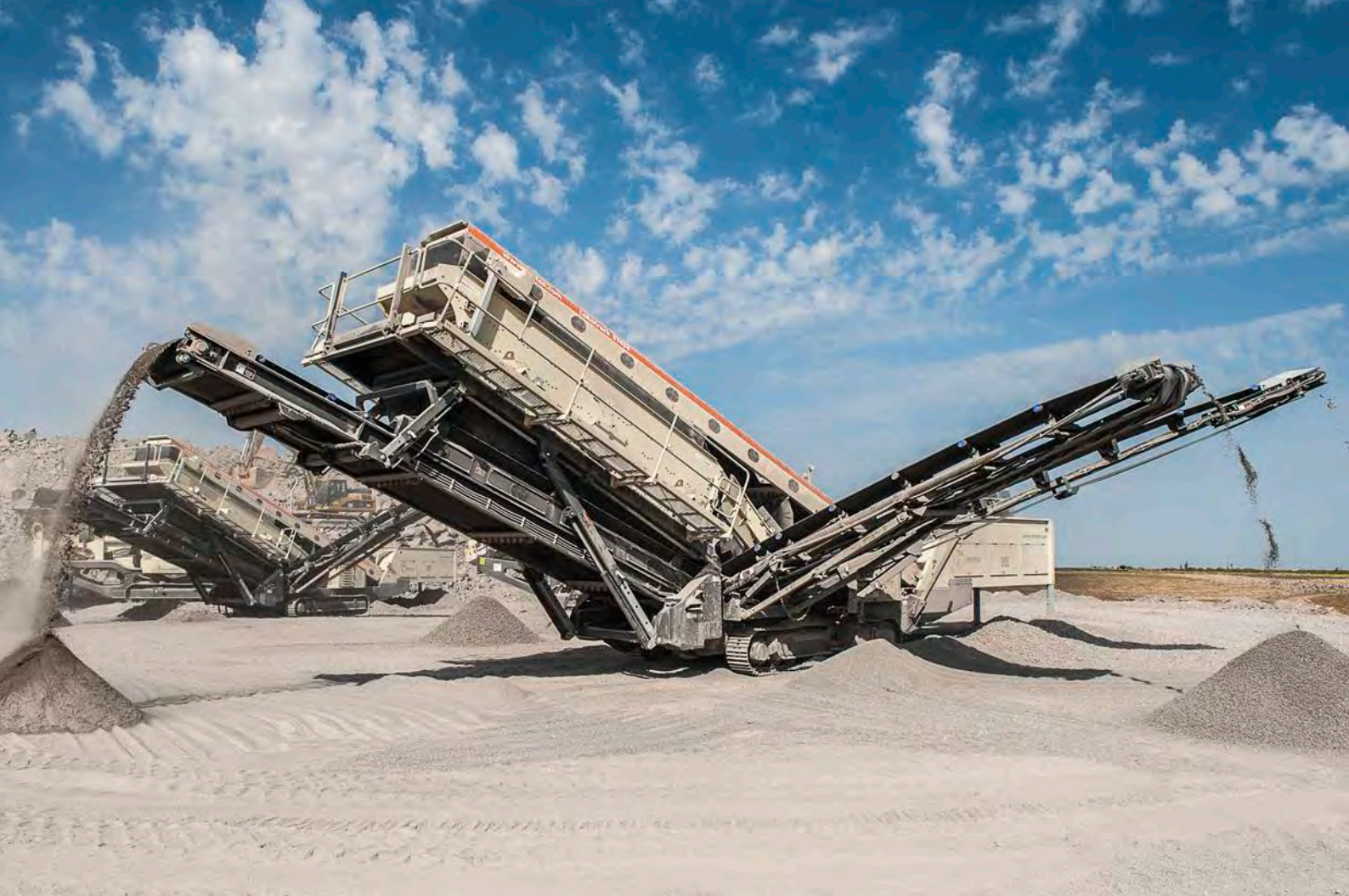
Metso ST4.8 Screen